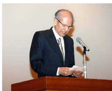
Dr. Shimomura expresses his appreciation on being conferred the Award.

The third “Nagasaki University Distinguished Alumni Award” was conferred upon Dr. Osamu Shimomura on Saturday, October 20, 2007 at the Nakabe Hall. This Award is to be given to a Nagasaki University graduate who has accomplished great achievements in his/her area of expertise as well as has having earned great fame for the University.