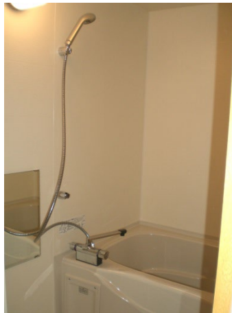
Room Facility 3