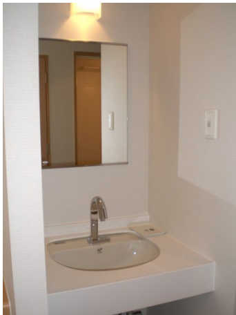
Room facility 2