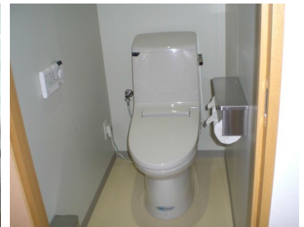
Room facility 1