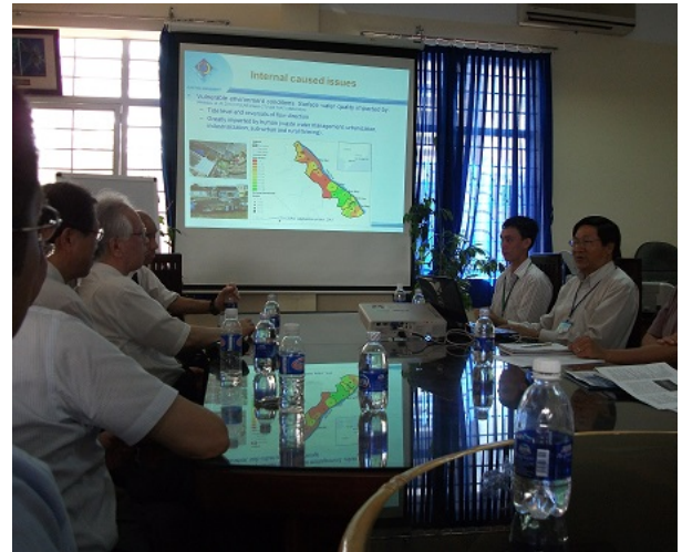
At the College of Environment and Natural Resources

For information about Can Tho University http://www.ctu.edu.vn/en/