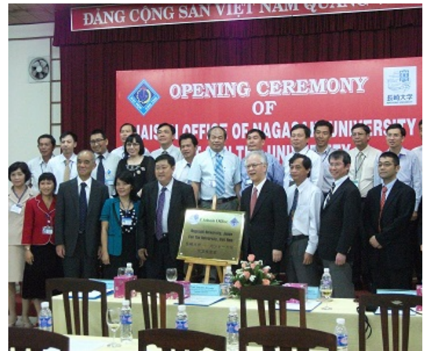
Faculty members of both universities